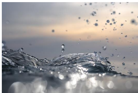
Cover Art provided by Canberra College student

Elaboration of these student capabilities and priorities are available on the ACARA website at www.australiancurriculum.edu.au .