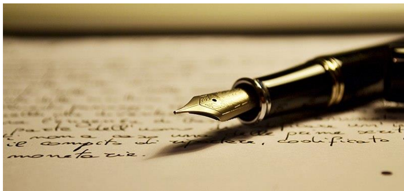
Power of Words by Antonio Litterio.jpg

Students have the right to appeal against the application and/or the outcomes of the above procedures. Refer to Board Policy on Breaches of Discipline in relation to school-based assessment and Your Rights to Appeal Leaflet.